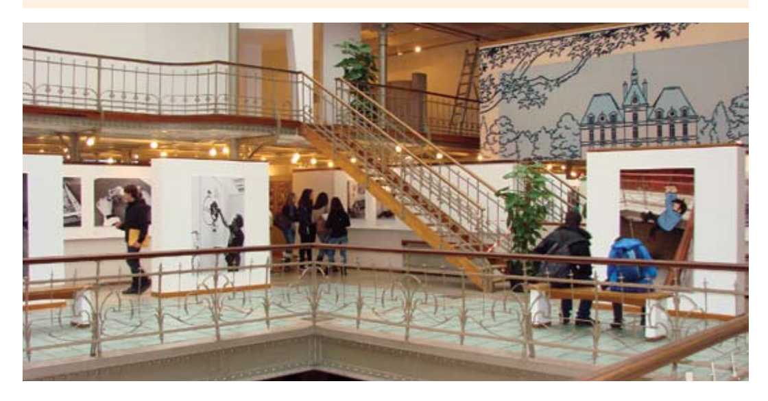
COMIC STRIP CENTER WHERE CHARACTERS FROM CHILDHOOD COME ALIVE