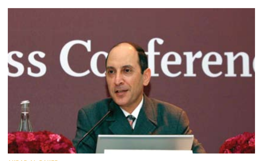
AKBAR AL-BAKER. CEO, QATAR AIRWAYS

F16S PILOTED BY THE BELGIAN AIR FORCE WELCOMES QATAR AIRWAYS INAUGURAL FLIGHT TO BRUSSELS INTO THE COUNTRY'S AIRSPACE