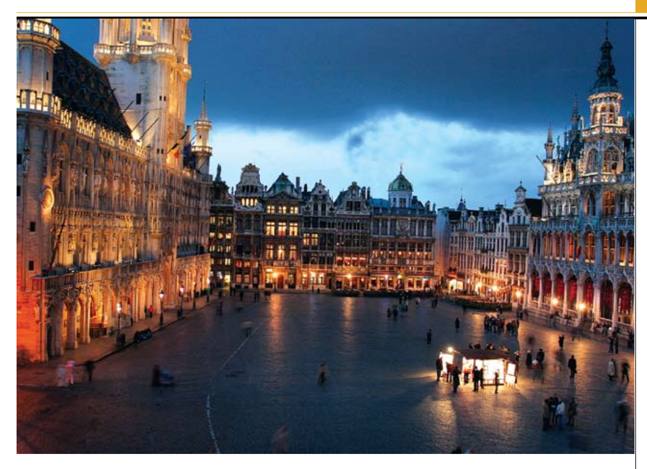
GRAND PLACE BY NIGHT

ping on an almost invisible road divider, flying across the street, landing on the pavement nose first, right in front of a fine dining restaurant, where a group of us were planning to celebrate our last night in Brussels. How aptly slapstick that this should happen in a country whose pride is its comic heritage.