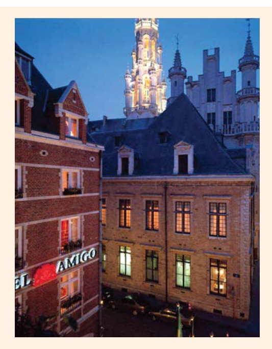
AMIGO THE FORMER JAIL IS NOW A LUXURY HOTEL

stone's throw away from the Grand Place, and walking distance from several shopping areas, museums and fantastic restaurants. Getting crisp speculoos from Dandoy or chocolates from Neu Hause demands nothing more than 10 steps out of the doorway. The quirkier reason is the kick of staying in what used to be a prison. The original building predates 1522, when the city council bought the building from a wealthy merchant and converted it to a prison. The Spanish rulers at that time mistook Flemish for prison to mean 'friend', and made it 'amigo'. As the guide joked, then it wasn't easy getting out of Amigo, now it's difficult to get into it. The Hotel was built by the Blaton family in 1957 on the occasion of the World Fair. In 2000, it became a part of the Rocco Forte collection. For bookings check www.roccofortecollecton.com.